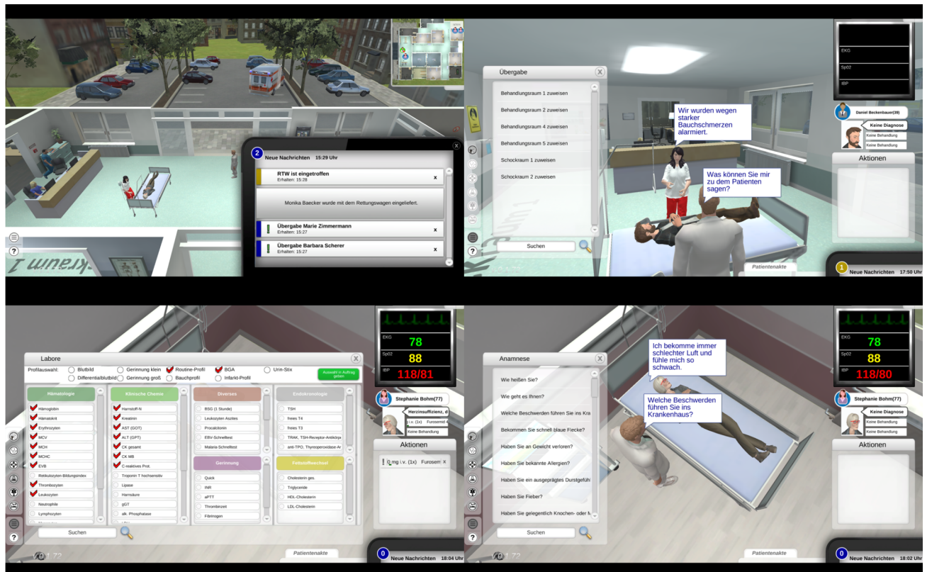
Fig 1. Screen shots of EMERGE. Top left, pager messages a new patient’s arrival. Top right, paramedic provides handoff information. Lower left, selection menu for laboratory tests. Lower right, selection menu for medical history.

https://doi.org/10.1371/journal.pone.0203851.g001