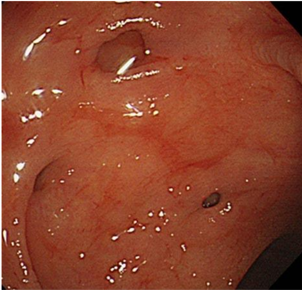
Fig. 1. Multiple diverticula.

Nakayama et al.: Diverticular Bleeding of the Colon during Combination Chemotherapy with Bevacizumab and Paclitaxel for Recurrent Breast Cancer