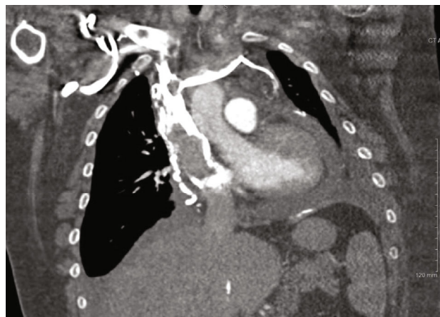
FIGURE 1: CT of the chest with SVC and subclavian thrombus.

Secondary chylopericardium is usually due to malignancy or trauma to the thoracic duct during surgery [3]. Rarely, it has been reported to occur secondary to thrombosis of the superior vena cava and subclavian veins, typically due to catheter-related thrombosis [1–3]. One case reported chylopericardium secondary to superior vena cava and brachiocephalic vein thrombosis following community-acquired pneumonia [4]. However, no previous case reports describe secondary chylopericardium due to a hereditary thrombophilia. We report a very rare case of chylopericardium secondary to SVC and left subclavian vein thrombosis in a patient with protein S deficiency.