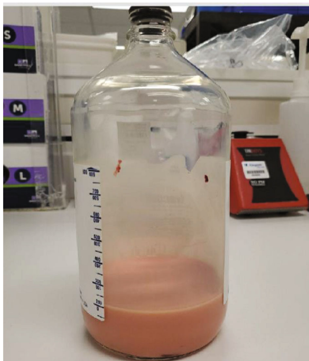
FIGURE 3: Chylous pericardial fluid.

Chylopericardium presents similarly to other causes of pericardial effusion. It varies considerably, ranging from asymptomatic to cardiac tamponade. Fatigue, dyspnea, and cough are the most common symptoms [1–3]. Initial workup includes a chest X-ray which may show an enlarged cardiac silhouette and echocardiography which can confirm the presence of pericardial effusion and evaluate for cardiac tamponade. Pericardiocentesis can be used for both diagnostic and therapeutic purposes. Analysis of the pericardial fluid in chylopericardium typically shows high levels of triglycerides and protein with an elevated lymphocyte count.