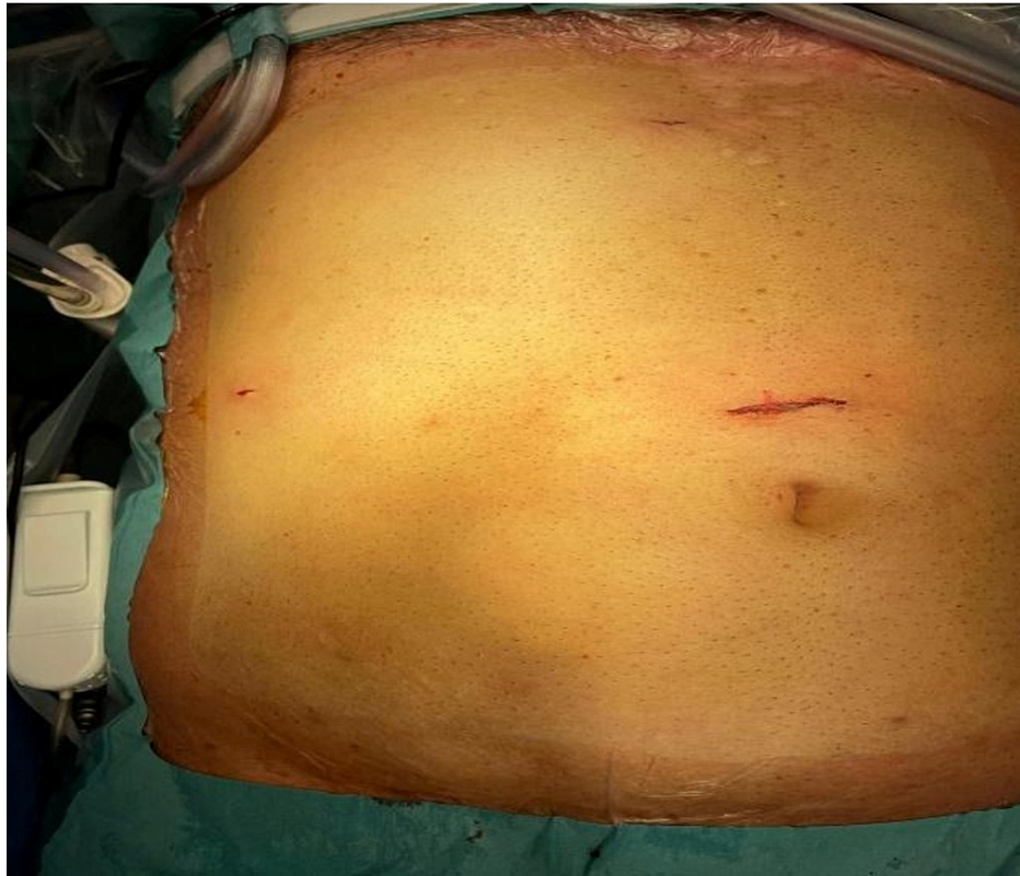
FIGURE 2: Ports position in three-port laparoscopic cholecystectomy.

Three-port laparoscopic cholecystectomy - a 10-mm supra-umbilical camera port, two 5-mm working ports in epigastric and right hypochondrium region.