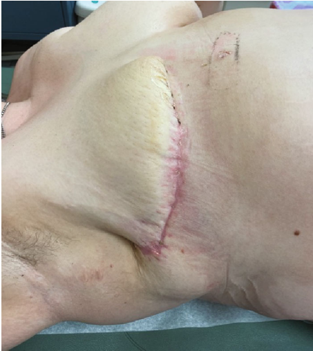
FIGURE 3: Well-healed mastectomy incision seen at 1-month postoperation; drains were removed.

The Laboratory Risk Indicator for Necrotizing Fasciitis (LRINEC) scoring system is a useful adjunct that has been shown to aid in the early diagnosis of necrotizing soft tissue infections. The LRINEC score consists of six biologic markers: total white cell count, hemoglobin, sodium, glucose, serum creatinine, and C-reactive protein. A score of 6 or greater is associated with a positive predictor value of 92% [4]. This when used in conjunction with common clinical findings (including edema, erythema, localized pain, presence of fluid filled bullae, signs of hemodynamic instability) should trigger clinicians to initiate aggressive resuscitation with intravenous fluids and broad spectrum antibiotics, in addition to emergent surgical consultation for early operative debridement. Other diagnostic adjuncts include imaging studies such as MRI, ultrasound, chest-computed tomography noting marked tissue inflammation, and possible locules of gas within subcutaneous tissue.