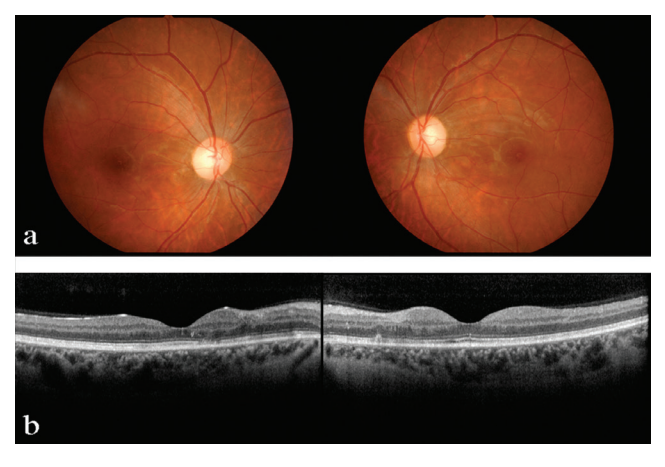
Figure 2. Fundus photography and optical coherence tomography findings in the third month of follow-up: (a) Total resolution of the retinal findings (b) Complete regression of subretinal fluid demonstrated by optical coherence tomography

In the nephrology clinic, a blood smear test, abdominal ultrasonography, and ADAMTS13 tests were performed for the differential diagnosis of acute kidney failure. The blood smear test showed schistocytes and erythrocyte fragmentation, and ADAMTS13 test was negative. Abdominal ultrasonography revealed bilateral grade 2 renal parenchymal hyperechogenicity with normal kidney sizes. After the systemic examinations and