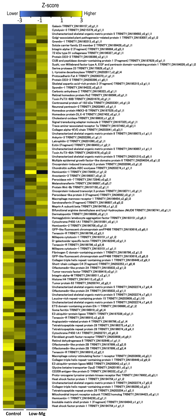
Figure 3 The top 50 most significantly up-regulated and down-regulated genes. Colors indicate the expression patterns of each gene (Z-score transformed FPKM values) between control and low-Mg conditions.