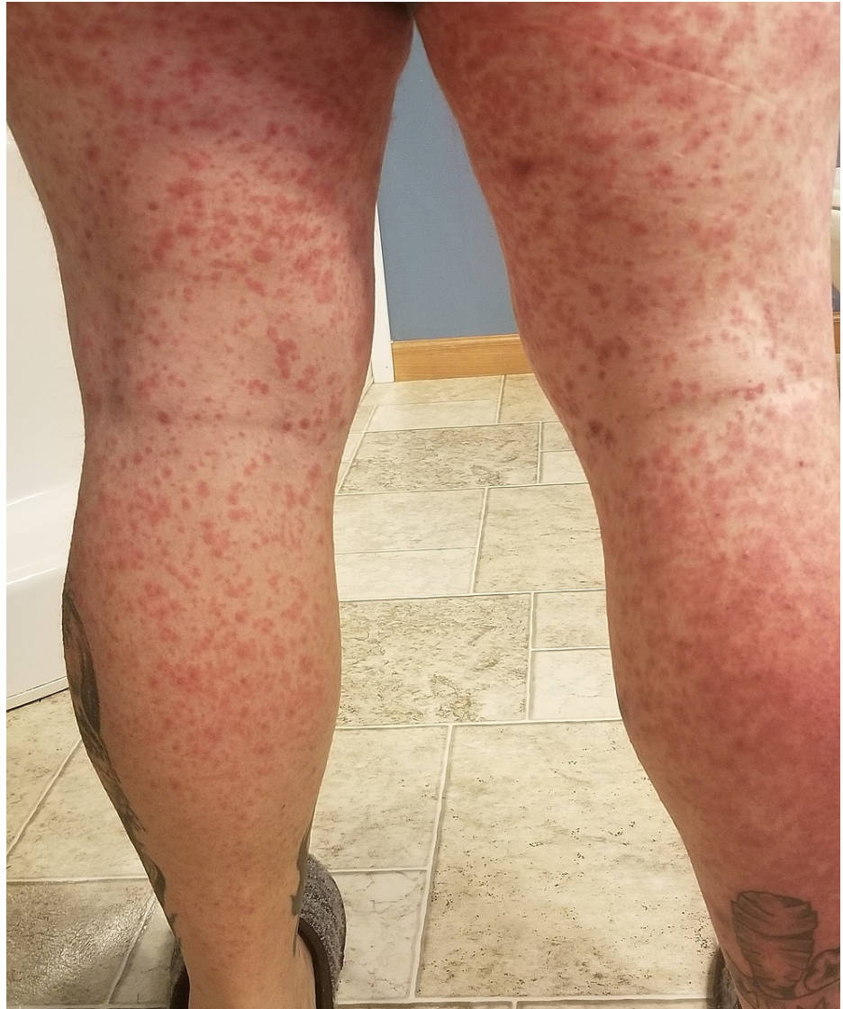
FIGURE 4: Diffuse maculopapular rash involving the posterior aspect of bilateral lower extremities.