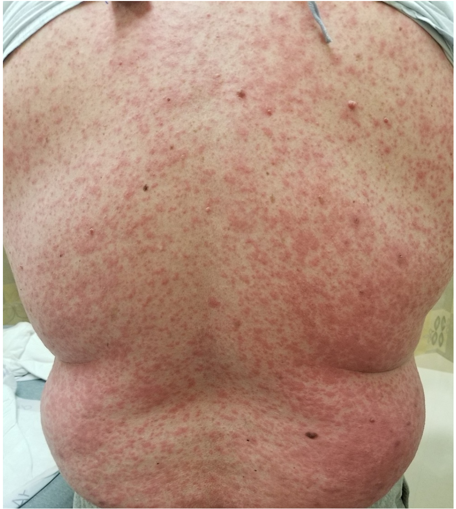
FIGURE 2: Diffuse maculopapular rash involving the trunk and back.