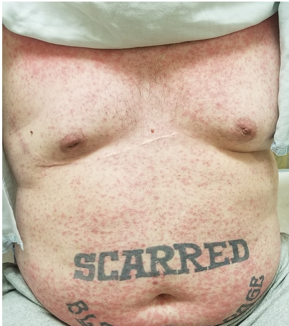
FIGURE 3: Diffuse maculopapular rash involving the chest and abdomen.