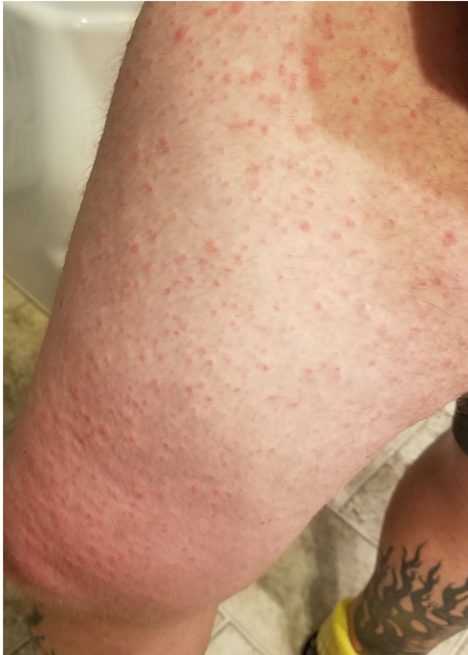
FIGURE 6: Diffuse maculopapular rash involving the anterolateral aspect of right thigh and knee.

The patient showed excellent clinical response after the first cycle of chemotherapy-immunotherapy combination. His shortness of breath was dramatically improved and did not require any further thoracentesis. As the tumor had 100% expression of PD-L1, and the patient showed excellent clinical response, the decision was made to continue with the chemo-immunotherapy combination, along with 10 mg of prednisone for the prophylaxis of immune-related adverse reaction. Following the second cycle, he developed significant neuropathy in bilateral lower extremities, and hence carboplatin and paclitaxel were discontinued. However, he was continued on single-agent pembrolizumab, along with 10 mg of prednisone as mentioned above.