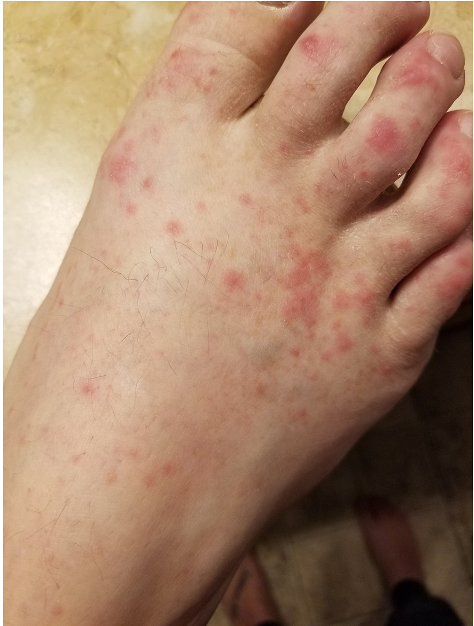
FIGURE 5: Maculopapular rash involving the right foot and toes.