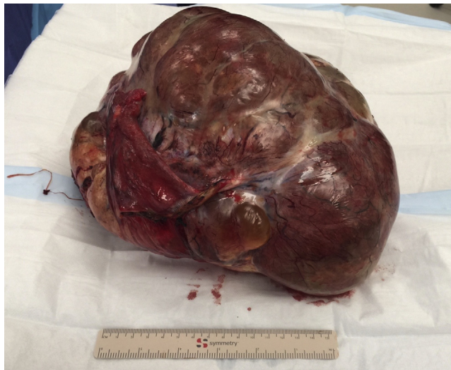
Fig. 3. Intra-operative photograph of the en-bloc resection specimen.

survival (35 vs 7 months), albeit with a high peri-operative mortality rate of 5% [10]. In another retrospective series, ovary-specific survival (date from KT diagnosis to death) in the oophorectomy group was favourable compared with the historical control group who did not undergo oophorectomy (20.8 vs 10.9 months) [4].