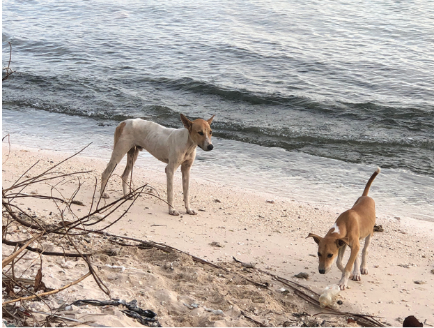
Figure 1. Living conditions of dogs on Tarawa Atoll, Kiribati.

led by the Mardi Chi Dingo Foundation ( https://fariervet.com/mardi-chi ; Figure 1), which aims to seek a sustainable locally driven solution to improving animal health and overpopulation problems. The protocol of this study was approved by the Animal Ethics Committee at the Faculty of Veterinary and Agricultural Sciences (University of Melbourne, Melbourne, Victoria, Australia; ethics identification no. 1914930).