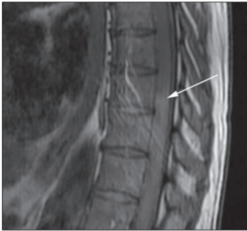
Figure 1: Sagittal T1-weighted image shows scattered multiple intramedullary hyperintensities in the thoracic lumbar cord (arrow)

total protein concentration was 12.1 g/L and lactate 15.9 mmol/L. Treatment consisted of intravenous ceftriaxone (4 g per day) and dexamethasone (48 mg/day) for the first four days. Penicillin-resistant (PRSP) and ceftriaxone-sensitive Streptococcus pneumoniae was cultured from CSF.