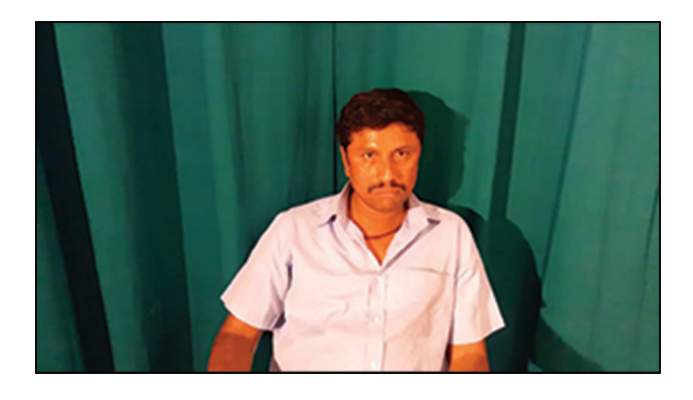
Video 1. Patient with Abnormal Vocalizations along with Continuous Orofacial Involuntary Movements. Continuous orofacial involuntary movements appear in the form of frequent opening and closing of the mouth and chewing movements.