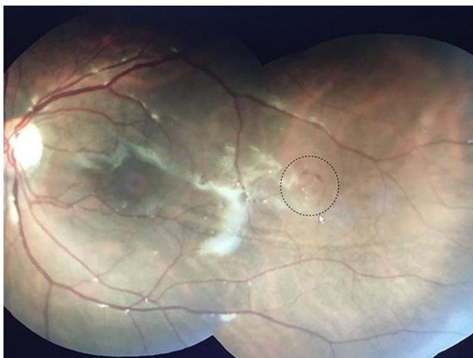
Fig. 3. Image of the apparently closed retinotomy area with the presence of the internal limiting membrane autograft 3 weeks after vitrectomy (arrow).