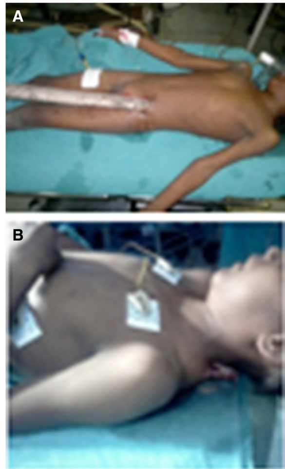
Figure 2 A, B Series of photos of the Patient in the resuscitating room. A bamboo stick impaled via the left lower abdomen exiting at zone 1 of the neck.

the radiology room. In concert, other members of the surgical team prepared for impending operative intervention. Antero-Posterior (AP) radiographs of the chest and abdomen were first taken (Figure 1). Again, the patient was hemodynamically stable and no haemothorax or pneumothorax was noted, so we proceeded with CT and deferred intervention such as chest thoracostomy (Figure 3A–C).