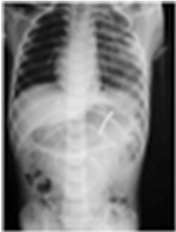
Figure 1 Chest radiograph at the time of the patient's hospital admission. Left lung middle lobe is contused (hematoma formation), with obliteration left costo-phrenic angle. The bamboo stake is barely discernible by faint translucent lines.

The team of on-call surgeons, anesthetists and radiologists were summoned immediately. After fluid resuscitation his vitals improved (BP 118/60 mmHg, pulse of 70 BPM) and oxygenation was maintained, so we proceeded to imaging for better surgical planning. Members of the ED, surgery and anesthesia teams accompanied him to