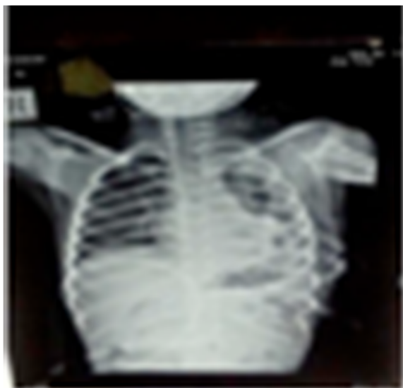
Figure 4 Post-operative X-Ray- showing left lower lobe lobectomy status with chest tube in situ.

The child remained intubated and was transferred to the ICU. Meropenem and clindamycin were added as the ICU team was concerned about contamination from organic matter and hollow viscus injury. These medications were donated free of charge. After extubation at 36 hours, he was transferred to the surgical ward. His postoperative period was complicated by superficial infection of the entry wound on the fourth hospital day, which was managed by local dressings and topical antibiotics. A psychiatric evaluation for post-traumatic stress disorder elicited no psychopathologic disorder. The child was discharged home after 21 days in the hospital and was recovering well on 1-month follow up without neurological or functional deficits.