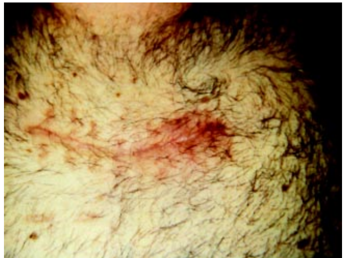
Figure 1. Surgical site infection following minimally invasive valve surgery.

Surgical site infections after minimally invasive cardiac surgery pose a challenge to the clinician. Physical findings of sternal instability and sternal click of the median sternotomy cannot be applied to many incisions used in minimally invasive cardiac surgery (Figure 1). The initial experience of