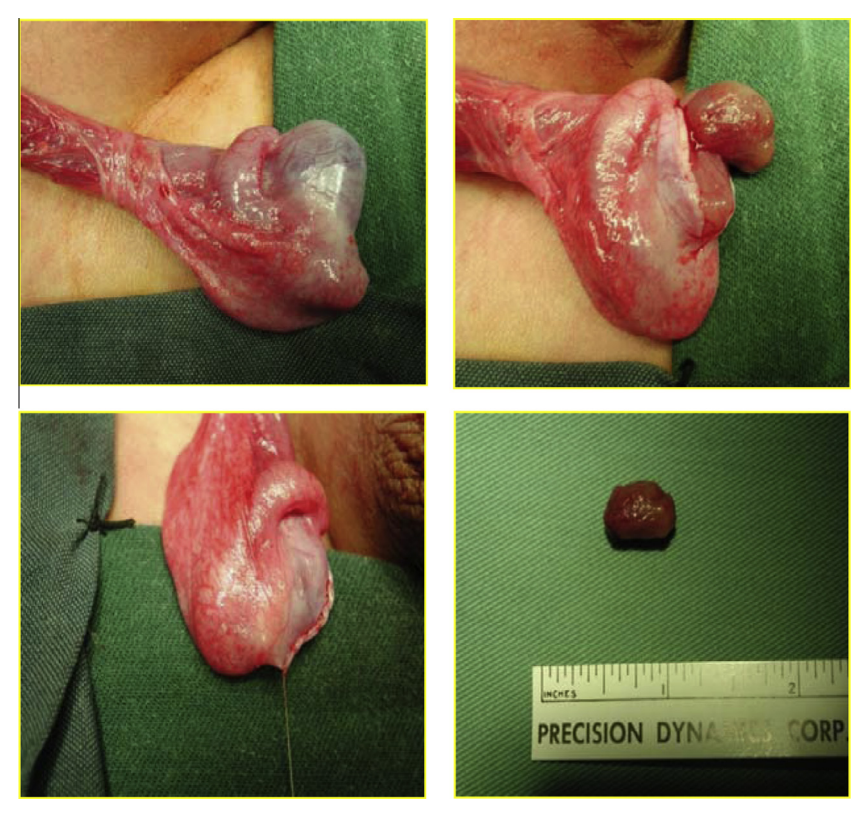
Figure 1 Intraoperative views from an 11-year-old boy with a right Leydig cell tumour.

The commonest type of prepubertal testicular tumour is the malignant yolk-sac tumour, followed by teratoma [2]. Furthermore, the 30-year data from one centre in Turkey showed that yolk-sac tumour is the most common type [3]. Analysis of data from four paediatric centres in the USA showed a much higher proportion of