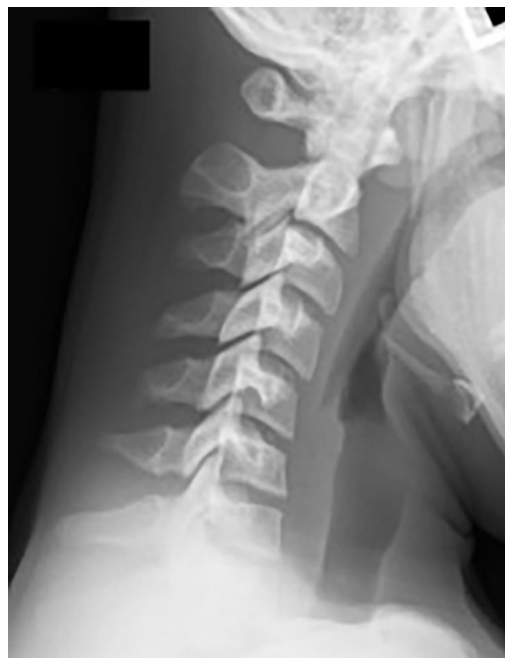
Image 1. Plain lateral cervical radiograph in flexion without abnormalities.

This case report is aimed to increase emergency physician awareness and discuss the approach to cervical trauma that can occur in sports related injuries.