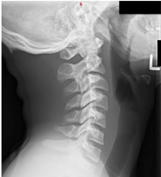
Image 2. Plain lateral cervical radiograph in extension without abnormalities.