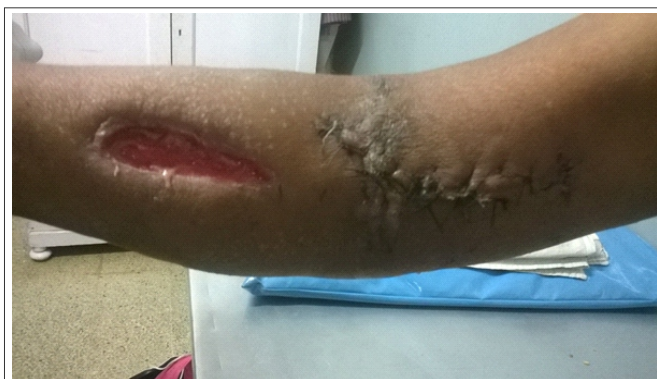
Figure 4: Photograph of patient right elbow showing fasciotomy wound and vascular repair surgical site

Closed posterior elbow dislocation is a common condition. Vascular injury is very rare in a closed dislocation without accompanying fracture. Clinically these cases present as acute limb ischemia/weak radial pulse on affected side. Occasionally such cases may present late with well perfused limb with palpable radial artery and normal capillary filling time [6]. Early recognition of brachial artery rupture in cases with elbow dislocation is very important, since it may lead to potentially devastating complications such as limb loss and Volkmann's ischaemic contracture. In the case presented here, we encountered a complete rupture of brachial artery; however, distal circulation was still maintained by rich collateral circulation around elbow. Perry et al reported that significant arterial injury exist without a detectable change in distal pulses or evidence of ischemia in 10% of the proven