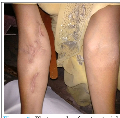
Figure 5: Photograph of patient right elbow showing full extension and healed fasciotomy wound