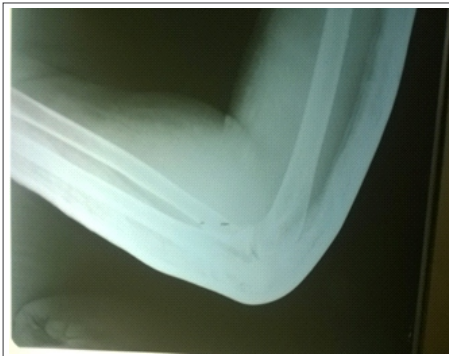
Figure 2: Post-reduction X-ray of right elbow showing well reduced dislocation