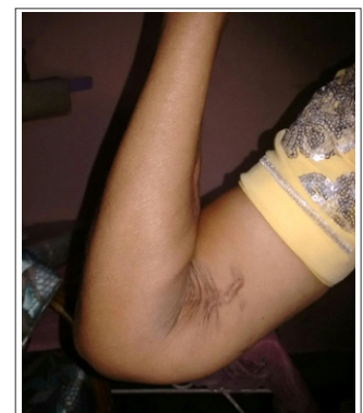
Figure 6: Photograph of patient right elbow showing full flexion