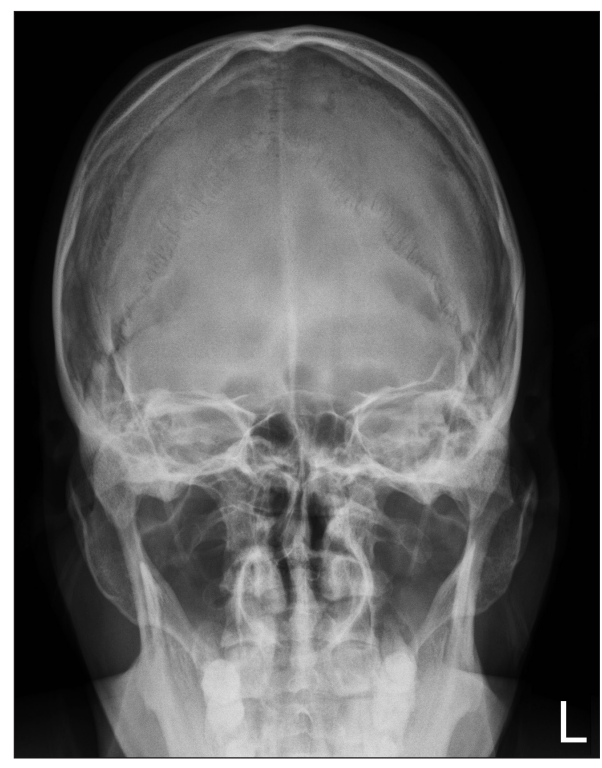
FIGURE 1. Skull X-ray anterior-posterior view showing no abnormal lesions.

After the operation, the patient received intravenous an-