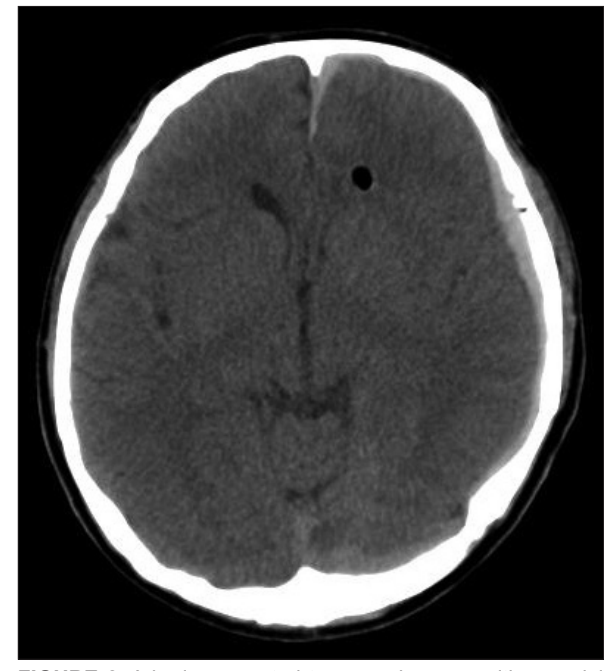
FIGURE 2. A brain computed tomography scan with an axial view demonstrating air density in the left frontal lobe and subdural hematoma on the left convexity.