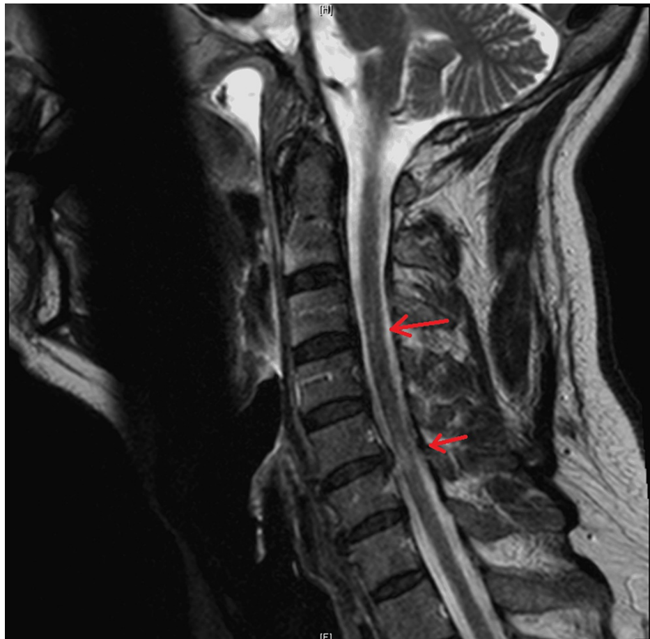
FIGURE 2: T2 hyperintense signal abnormalities seen at C3 and C6-C7, seen on sagittal cervical spine

Signal abnormalities are indicated by the red arrows.