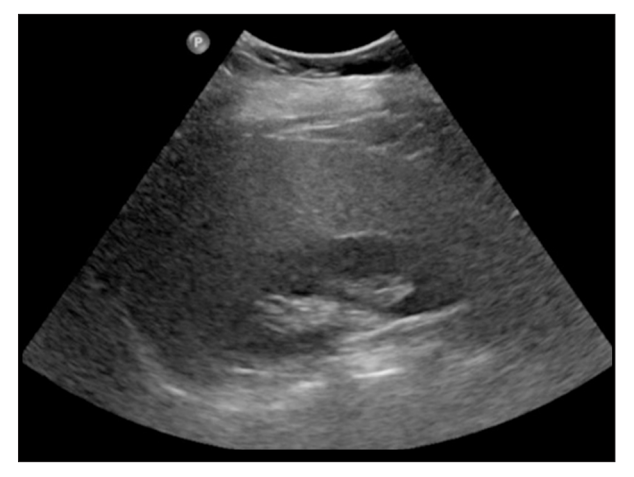
Figure 2. Ultrasound abdomen showing increased liver echogenicity compared to kidney.

kidneys (Figure 2). The patient was referred to a pediatric gastroenterologist due to the history of transaminitis and the imaging findings.