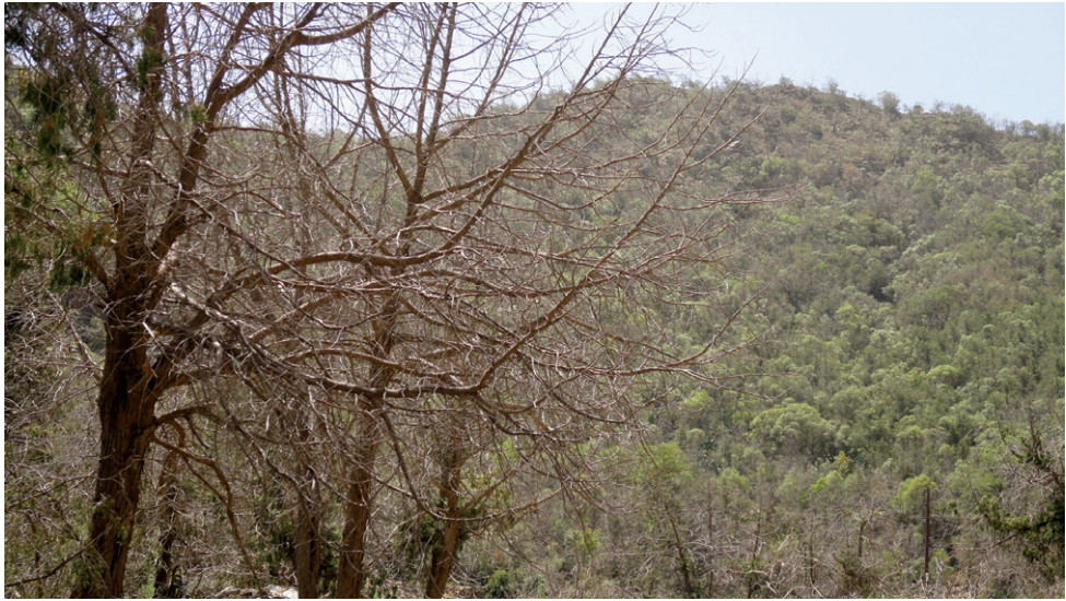
Figure 8. Type locality, Amadan forest, Al Mandaq governorate, Al Bahah province, Kingdom of Saudi Arabia.