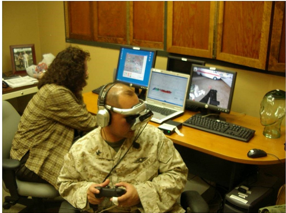
FIGURE 1: Three computer configurations for VR-GET with biofeedback being calculated on the laptop computer. Simulated combat veteran/non-patient is holding a handheld controller to “move” through the combat environment. A head-mounted display and headphones facilitate the immersion in the VR-GET simulated combat environment.