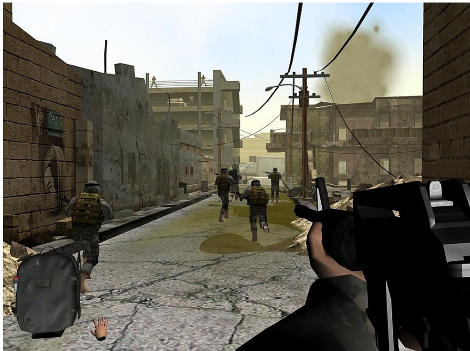
FIGURE 2: What the VR-GET combat veteran sees while immersed in the VR-GET combat environment titled “Fallujah.”