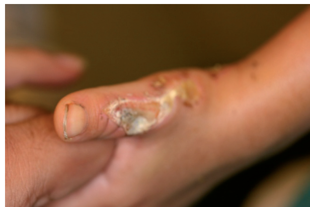
Figure 6. The only case of dorsal hand injury seen in a 6 year old child