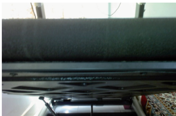
Figure 1. An elevated treadmill at its end, the rolling mat above and the bar beneath the machine.

From 2006 to 2011, 8 children with treadmill injury were seen in our clinic. The patients' demographic data such as gender, age, location of the injury in the upper extremity, severity of the injury, the time between the onset of the injury and treatment, the kind of treatment including wound care method and surgical method were studied. In superficial injuries, treatment consisted of daily dressing, early physiotherapy and using of night splints. All our patients were seen in the chronic stage of the disease with flexion contracture of variable severity. The surgical method was release of the contracture by multiple Z-plasty without skin graft and after suturing of the flaps the finger was placed under linear distraction by pentagonal frame or other methods and continuous distraction applied using rubber bands (Figure 3)