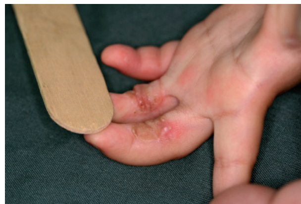
Figure 2. A recurrent grafted treadmill injury, note the skin discoloration.

The distraction was held until complete healing of the wound was achieved and then for 1-2 weeks dynamic distraction was started. The dynamic distraction is done after removing the wire holding the finger in distraction and replacing it with a spring and the physiotherapist can then begin with moving of the finger/s. With complete wound healing the frame was removed and a thermoplastic orthosis was placed (Figure 4). The removal of the orthosis is a scheduled program and began with daily removal of one hour two times daily and gradually increased until the orthosis is worn only during rest or at night. The orthosis must be worn at least for a period of 4