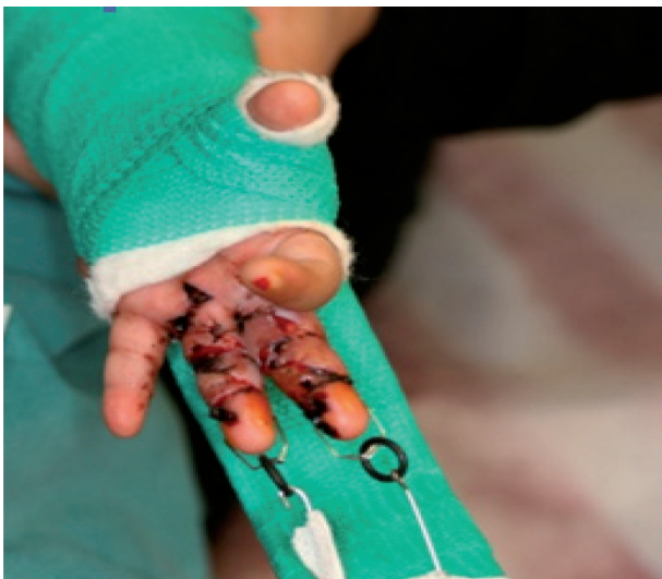
Figure 3. Pentagonal frame in place distracting the fingers at two weeks postoperative

Use of treadmills at home is increasing, as noted by an increase in reports of injuries related to this device. Estimating the incidence of these kinds of injuries in toddlers and children is difficult because many patients with small injuries do not come to physicians; on the other hand, there is no specific center to record these patients and this makes it even more difficult to estimate the incidence of these kinds of injuries in children. In the US there are about 8700 injuries related to home sports equipment reported annually. Considering the recorded data in the US, there have been 1009 hand injuries related to treadmills in a 4-year period, 300 cases of