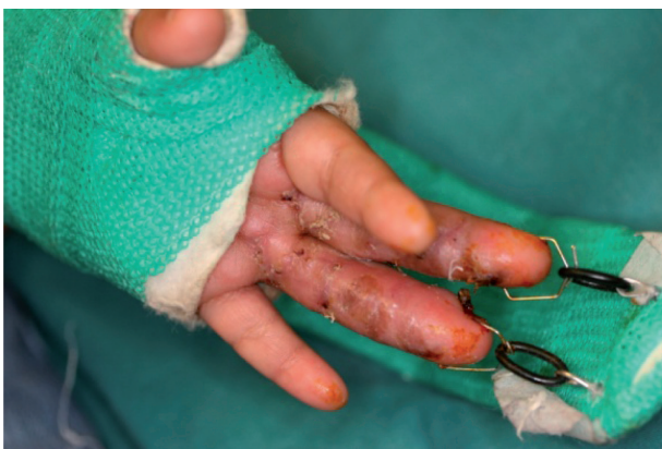
Figure 4. The wounds are completely healed and the frame and splint can be removed.