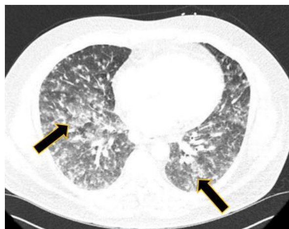
Figure 3. Patient 2 CT scan of chest with evidence of granulomatous disease