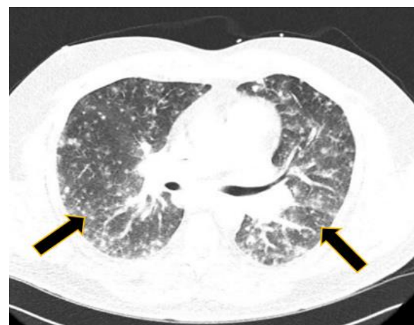
Figure 4. Patient 2 CT scan of chest with evidence of granulomatous disease

Positive tests included Histoplasma serum antigen of 5.88 ng/ml (range: 0.19-60.0 ng/ml) and positive