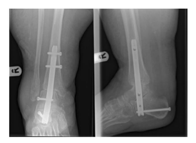
Fig. 3 Post-operative radiographs after TCC nailing.