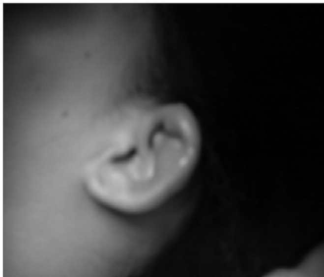
Figure 4. Sequelae