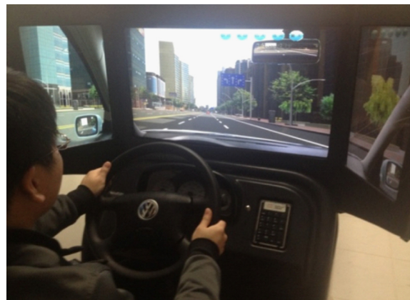
Fig 1. The driving simulator used in this experiment.

Driving environment. The simulated driving environment was a 3.6 km route of city streets [Fig 2]. Participants drove following audio instructions. In about one fifth of the route, the speed limit was 40 km/h, and it was 60 km/h for the rest of the route. Unexpected incidents sometimes happened. For example, a bike rider suddenly changed lanes to avoid parked cars