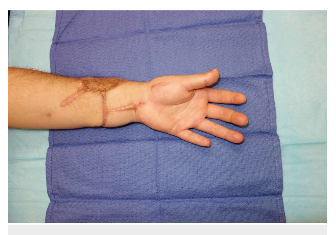
FIGURE 5: Postoperative outcome

Image depicting the palmar aspect of the hand and forearm six years postoperative, demonstrating the moderate hypertrophic scarring from the patient's previous procedures. These scars did not affect his overall functional outcome.