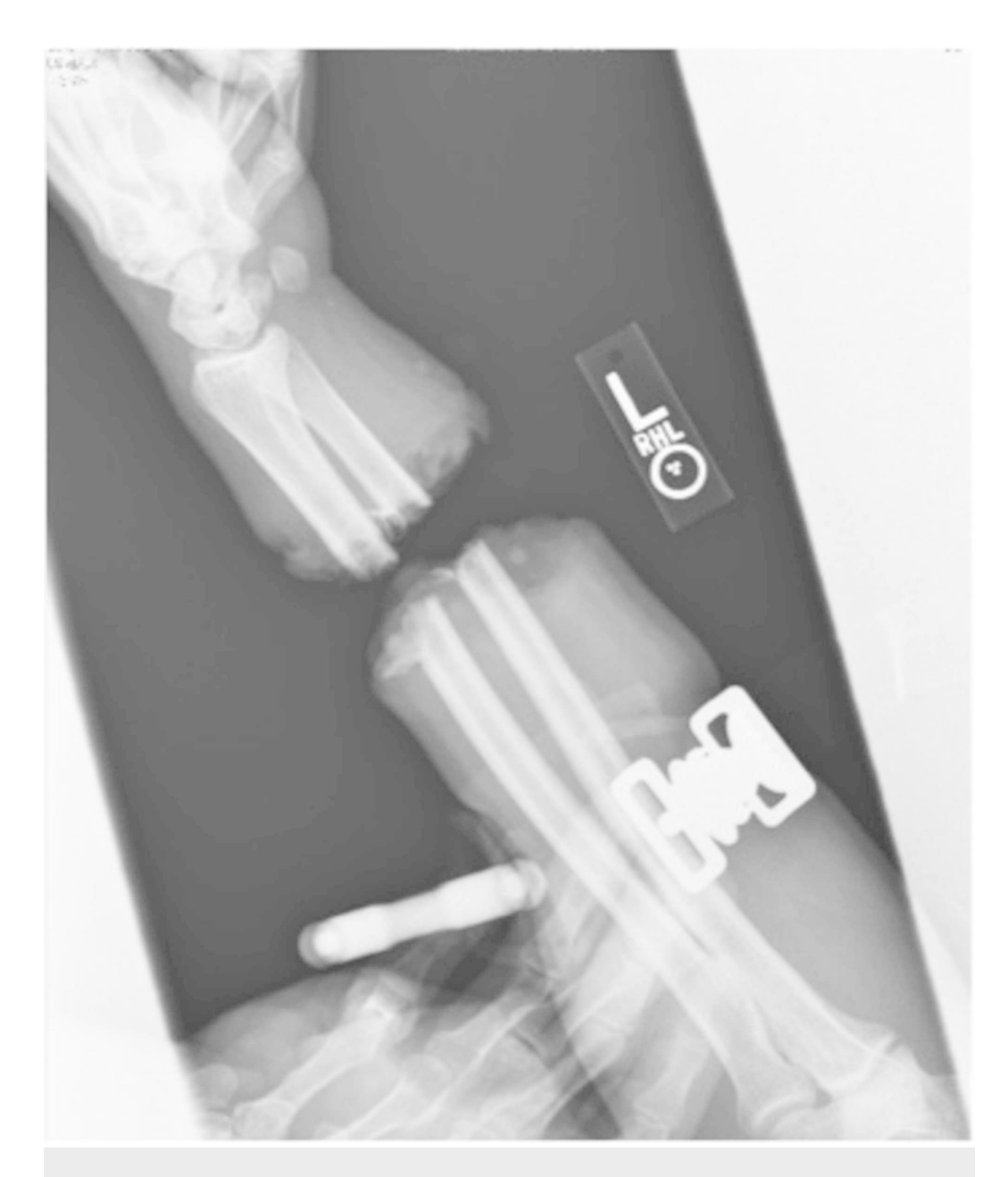
FIGURE 1: Forearm X-rays

Forearm X-rays demonstrating a transverse radius and ulna forearm fracture at the mid-forearm location. X-rays demonstrate little comminution at the fracture sites.