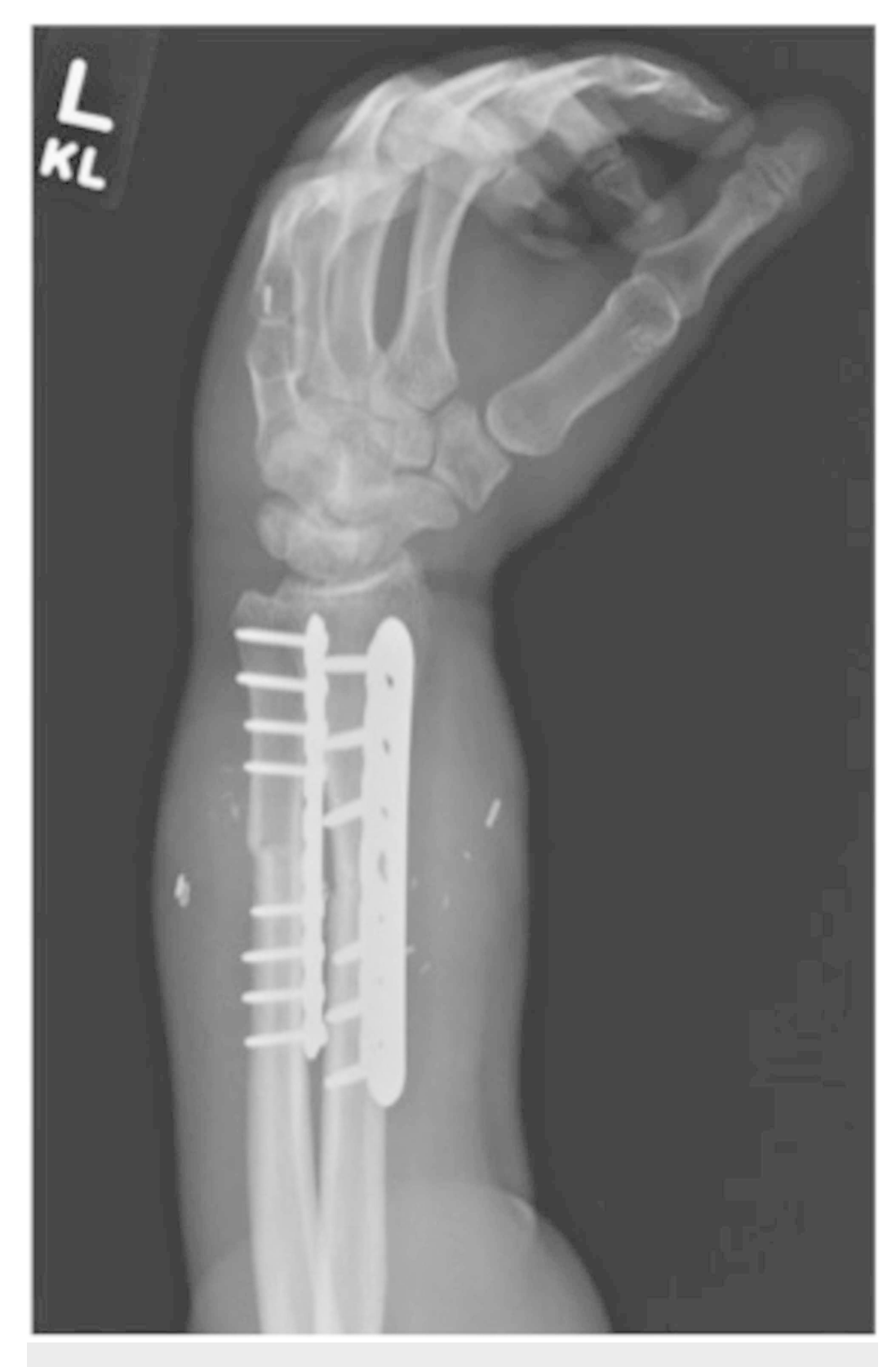
FIGURE 3: Oblique X-rays after plating

Oblique X-rays demonstrating the radius and ulna forearm fixation after compression plating. Radius and ulna were both shortened by approximately 4 cm to allow for a tension-free repair of the vital soft tissues.