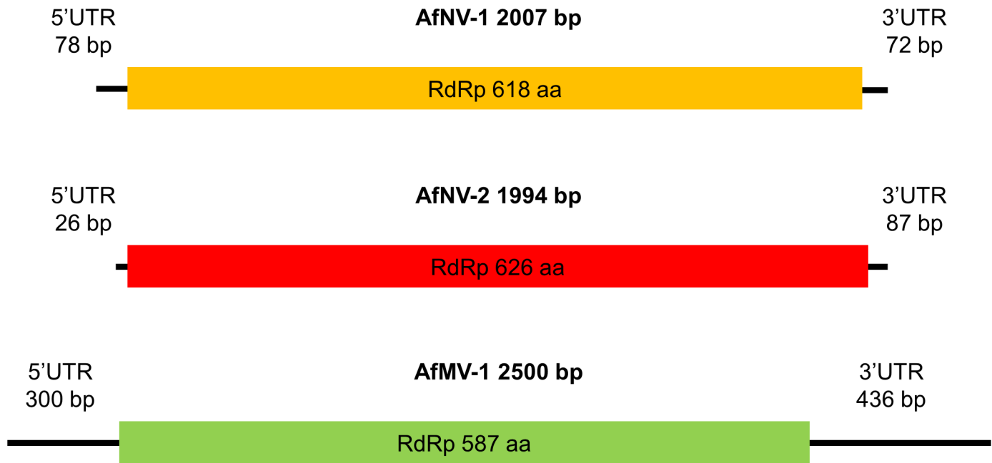
Fig 3. Schematic representation of the genomic organization of the novel narnaviridae Aspergillus fumigatus narnavirus-1 (AfuNV1), Aspergillus fumigatus narnavirus-2 (AfuNV2), and Aspergillus fumigatus mitovirus-1 (AfuMV).

https://doi.org/10.1371/journal.pone.0200511.g003