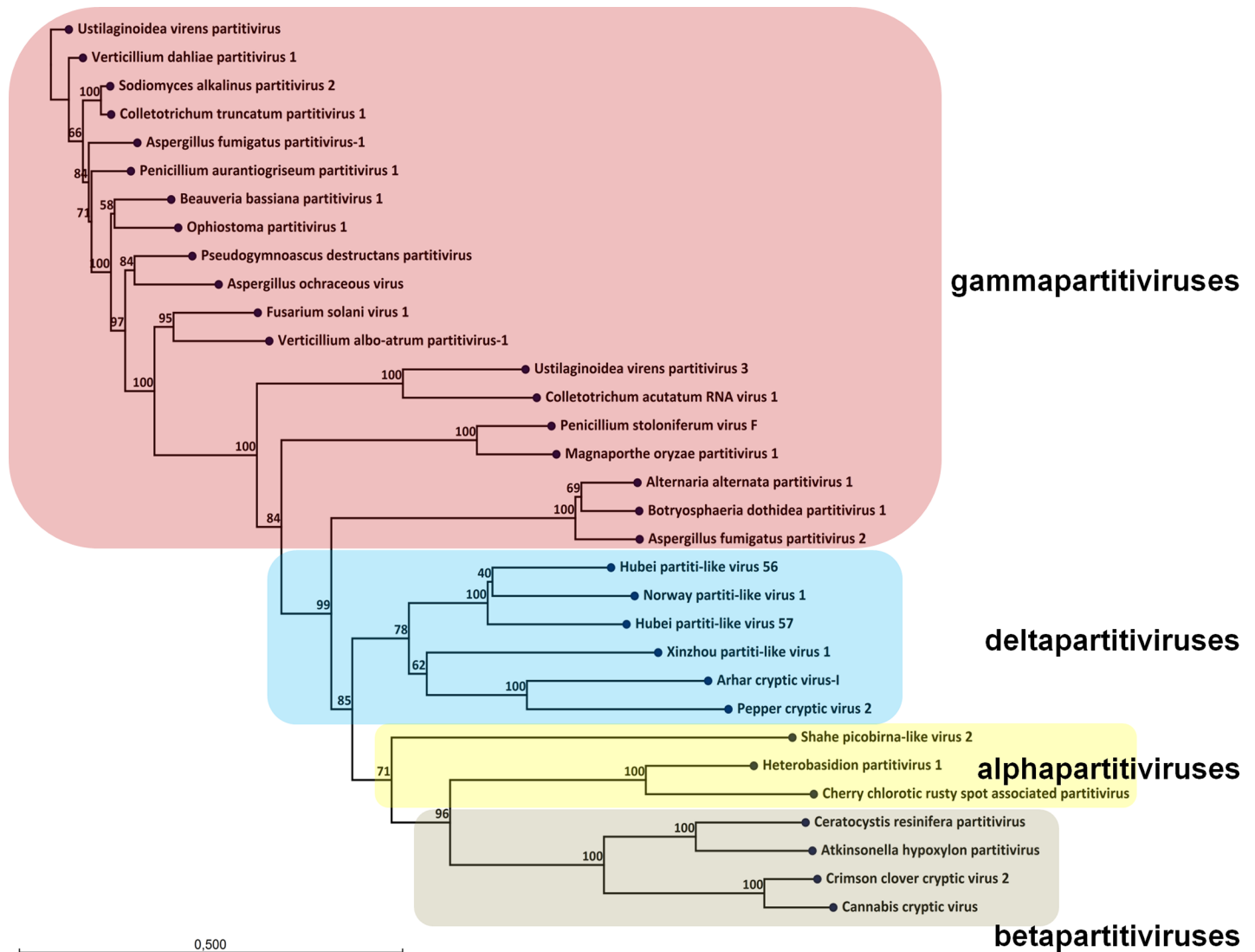
Fig 2. Phylogenetic relationships of the family partitiviridae. An unrooted phylogenetic tree was calculated from a multiple alignment of the RdRp protein using the maximum likelihood method with 1000 bootstrap replicates. The various subgenera are indicated by colored boxes.

https://doi.org/10.1371/journal.pone.0200511.g002