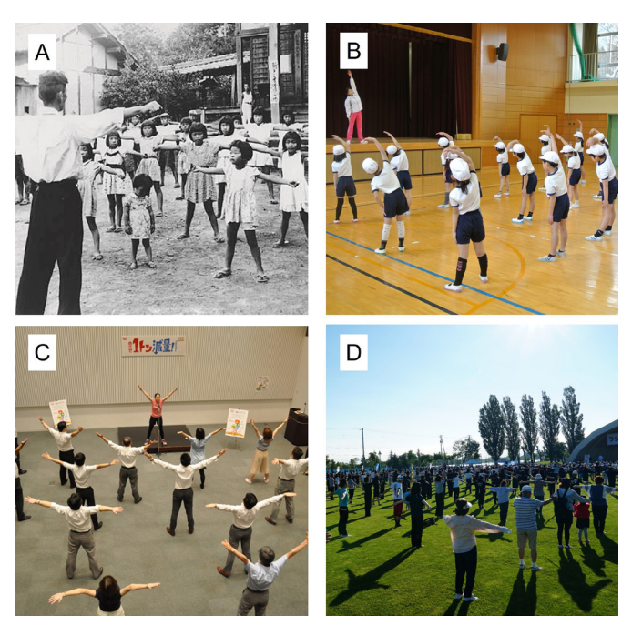
Figure 1 Pictures of Radio-Taiso as a firmly established, traditional Japanese exercise programme. (A) Communitydwelling children get together to practice Radio-Taiso. (B) Physical education classes. (C) Practice in the workplace. (D) Gathering and practising during community events. All pictures were provided by courtesy of Japan Post Insurance Co., Ltd.

on improving physical outcomes.<sup>3</sup> Studies focusing on patient-reported outcomes (eg, health-related quality of life (HR-QoL)) may address the gaps between scientific evidence and clinical practice.<sup>4</sup> Exercise interventions are reportedly the most effective for improving HR-QoL among older adults with frailty, but this warrants validation in robust clinical trials.<sup>5</sup> Nevertheless, evidence for the effects of home-based exercise interventions on HR-QoL remains scarce.<sup>6</sup> As older adults with frailty exhibit decreased mobility,<sup>7</sup> readily available home-based exercise programmes are feasible and rational interventions.