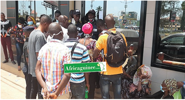
Photo: Customers gathered in front of a bank without respecting physical distancing and not all of them wore face masks, Conakry, Guinea, March 31, 2020.

Korea and Singapore were able to speedily contain COVID-19 by taking advantage of lessons learned from the management of previous outbreaks of Severe Acute Respiratory Syndrome (SARS) and Middle East Respiratory Syndrome (MERS) [14,15]. Guinea could also build on its experience of community engagement in the Ebola response. Indeed, the involvement of community-based organizations and community leaders in response activities contributed to overcoming community reluctance against response actions, a better observance of prevention and control measures, the improvement of contact tracing, and the referral of suspected cases to the Ebola treatment centers [16]. Such an innovative initiative could be adapted to the response to COVID-19, remaining mindful of the differences between Ebola and COVID-19.