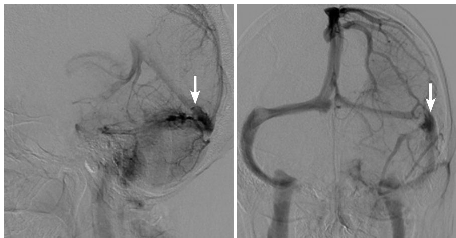
Fig. 2. 4 Vessel angiogram shows dural arteriovenous fistulas (arrows) fed by multiple branches of arteries.

Imaging modalities for the patients with pulsating tinnitus are necessary to detect the potentially treatable vascular etiologies, and they include computed tomography angiography (CTA), non-enhanced CT of the temporal bone, MRI and MRA, catheter angiogram [9]. CTA is considered as initial imaging examination of choice, because it provides a robust assessment of various intra- and extratemporal vascular pathologies, including DAVF, as well as an excellent description of the bony anatomy of the temporal bone [8]. Temporal bone CT may represent the transosseous vascular shapes, which are highly specific for the diagnosis of DAVF [9]. MRI and MRA have advantages in detecting abnormal vascular pathologies asso-