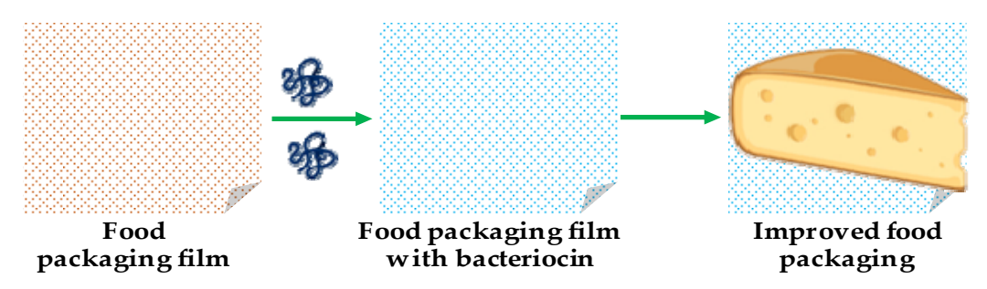
Figure 3. Schematic representation of improved food packaging with bacteriocin.

Chitosan is another type of nanoparticle, which is widely used with bacteriocins in various biomedical applications. Chitosan is an ideal candidate for these applications due to its non-toxic, biocompatible, and biodegradable nature [51]. Moreover, its antibacterial and anticancer activity coupled with its ability to deliver drugs to their targets is well researched [51,52]. Many researchers have used chitosan with bacteriocins to obtain a material showing synergistic antibacterial activity. For instance, Namasivayam et al. [53] reported synergistic antibacterial activity of chitosan-nanoconjugates loaded with bacteriocins against Listeria monocytogenes; the activity levels of these nanoconjugates were higher than those of free bacteriocins. In another study, Alireza Alishahi [54] demonstrated excellent antibacterial activity by chitosan nanoparticles loaded with nisin against E. coli and S. aureus. Moreover, nanocomposite comprised of bacteriocin and chitosan have also been used in food packaging (Figure 3). For example, Divsalar et al. [55] formed a composite film containing chitosan, cellulose, and nisin for use in packaging of ultra-filtered cheese. The composite film showed better food packaging properties than chitosan and cellulose film alone. Similar studies have been conducted using bacteriocin-chitosan nanocomposites for drug delivery [56].