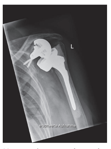
(a) Periprosthetic joint infection of an inverse shoulder arthroplasty on the left shoulder of a 75-year-old woman 3 years after implantation with a loose glenosphere and glenoidal bone defect and a stable shaft implant