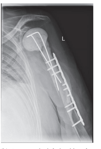
(b) Spacer at the left shoulder after removal of the infected inverse shoulder arthroplasty with plate osteosynthesis because of periprosthetic fracture during the stem removal