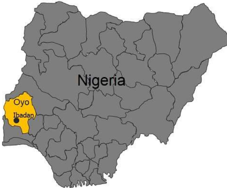
Figure 1: map of Nigeria showing the study area