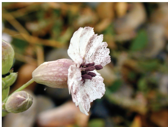
Figure 1. Anther-smut disease of Silene uniflora , caused by the fungi in the genus Microbotryum . The teliospores of the fungal pathogen replace the pollen of the plant and are carried to other plants by insect pollinators.

The host Silene uniflora (= Silene maritima ) harbors populations of Microbotryum lagerheimii and Microbotryum silenes-inflatae . Within Microbotryum on European Silene , based on DNA sequences of three single copy