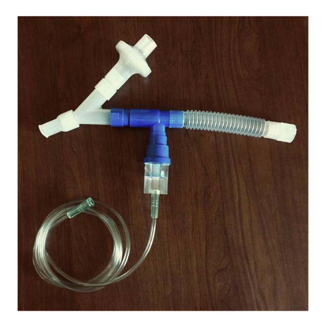
FIGURE 5. Nebulizer with a 1-way valve and expiratory filters.

bronchodilator responsiveness. Methacholine challenge is addressed in a following section.