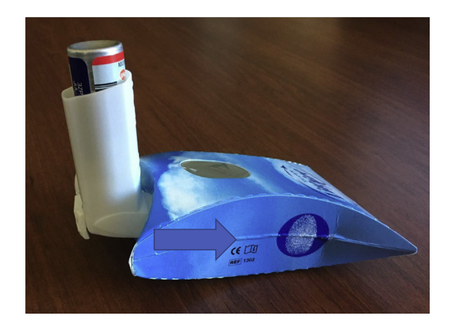
FIGURE 4. Metered dose inhaler with a single-use valved holding chamber. Example shown is: https://www.macgill.com/products/ respiratory/peak-flow-meters-spacers/liteaire-dual-valved-holding-chamber.html. The arrow points to the valved holding chamber.

viral filters should be used as they help minimize the risk from exhaled air contaminating the spirometer and the room. Disposable nose clips should be used and discarded after each patient use. After each patient, equipment should be cleaned with 70% isopropyl alcohol (or equivalent) or the disinfectant recommended by the manufacturer.