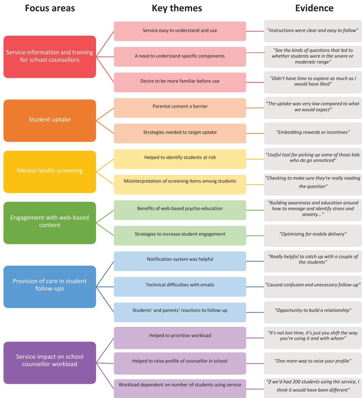
Figure 2. Key themes related to school counsellors' experiences of Smooth Sailing.

matching the confidential student service identification codes listed in the email with the student names list. The Smooth Sailing service did not mandate the type of care that school counsellors were to provide; however, the counsellors formally agreed to facilitate the in-person follow-ups in a way that aligned with their professional codes of conduct, duty of care and school policies. Two days after the visit, the research team contacted the school counsellors to confirm that the follow-ups were completed. To respect students and school counsellors' right to privacy and confidentiality, the pilot trial did not require the school counsellors to disclose the specific nature of actions taken for each student after a follow-up was initiated.