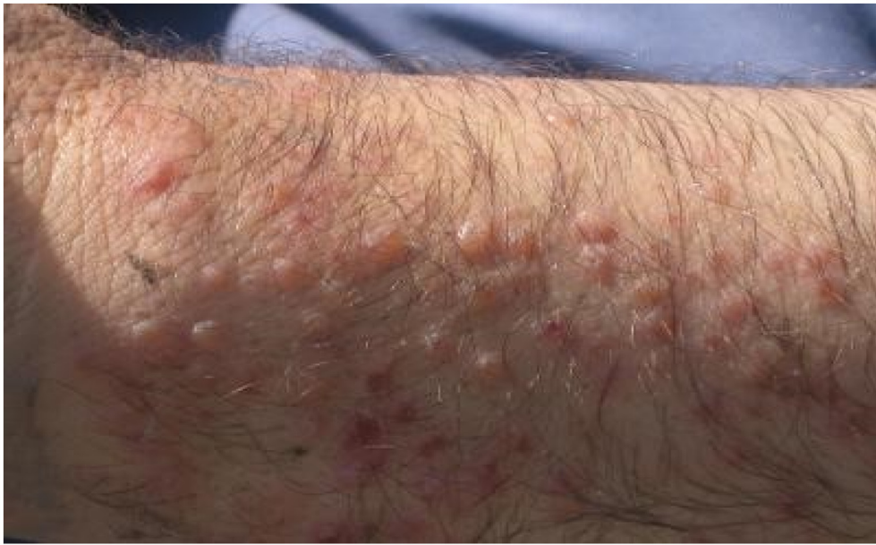
Fig. 2. Rashes on the hands of a farmer in Fereydoon Kenar town (north of Iran).

Previous studies on avian schistosomes in Mazandaran Province focused only on migratory birds (Fakhar et al., 2016); but in the present study for the first time we report nasal schistosomes of both domestic and migratory ducks in this region. In fact, our present work, along with previous studies conducted in the area (Ashrafi et al., 2018; Fakhar et al., 2016), was able to complete main part of the Trichobilharzia life cycle puzzle (snail and ducks) in the region. Various regions of the Mazandaran Province are suitable places for the winter migratory birds. Every year thousands of birds migrate to the northern provinces of Iran from the Central Europe and Russia (Jouet et al., 2009; Behrouzrad, 1994). This region is a major stopover for migratory birds and also has a high incidence of HCD, particularly in rice farms (Rahimi Esboei et al., 2013; Pflieger, 1999). According to the results of this study, infection with avian schistosomes is endemic in wild and domestic ducks of Mazandaran Province, so migration of waterfowl toward the northern parts of Iran can transmit and distribute avian schistosomes in their migratory routes in the environment. Close association of wild ducks, domestic ducks and intermediate snails of avian schistosomes in water resources, provide a persistent risk of exposure to HCD for farmers in this region (Ashrafi et al., 2018; Fakhar et al., 2016).