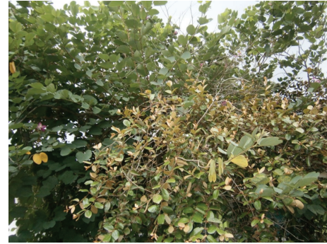
FIGURE 1: Mistletoe on host tree.

The anticancer effect of ML-I depends on activities exerted by both the A-chain and the B-chain. Carbohydrates are bound to the B-chain which mediates the cellular uptake of the hololectin. Cytotoxic A-chain inhibits the elongation step of protein biosynthesis by catalysing hydrolysis of the N-glycosidic bond at adenine-4324 in the 28S RNA of the 60S subunit of ribosomes, resulting in apoptosis or necrosis cell death [36, 37]. The immunomodulatory activity of mistletoe