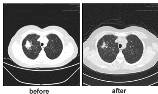
Figure 2. Radiographic Response of Patient 5. He had reduced tumor size after gefitinib treatment, supporting the liquid biopsy (L858R) irrespective of the wild type EGFR in the tumor tissue.

Targeted therapy improves the response rate and helps to lengthen the OS in NSCLC patients. Successful targeted therapy relies on the determination of mutation status, which is restricted by the availability of the tumor tissue. Therefore, liquid biopsy provides an invaluable alternative source for the biomarker analysis. Previous studies compared the sensitivity and specificity of liquid biopsy with tumor tissues. A pilot study by Bai et al reported a sensitivity of 82% and a specificity of 90% in their series of 230 patients by high-performance liquid chromatography (Bai et al., 2009). The high sensitive ARMS method achieved a sensitivity about 70% and a specificity near 100% were reported (Liu et al., 2013; Douillard et al., 2014). The application of dPCR achieved a high consistency of over 80% (Yung et al., 2009). In this study, a high consistency of EGFR mutation between liquid biopsy and tumor tissues (88.5%) was also observed. The extraordinary high consistency was explained several aspects. In this study, high sensitive methods (ARMS, dPCR, or NGS) were used. This cohort consisted of only patients with metastatic diseases where high abundance of cfDNA was present. The sufficient