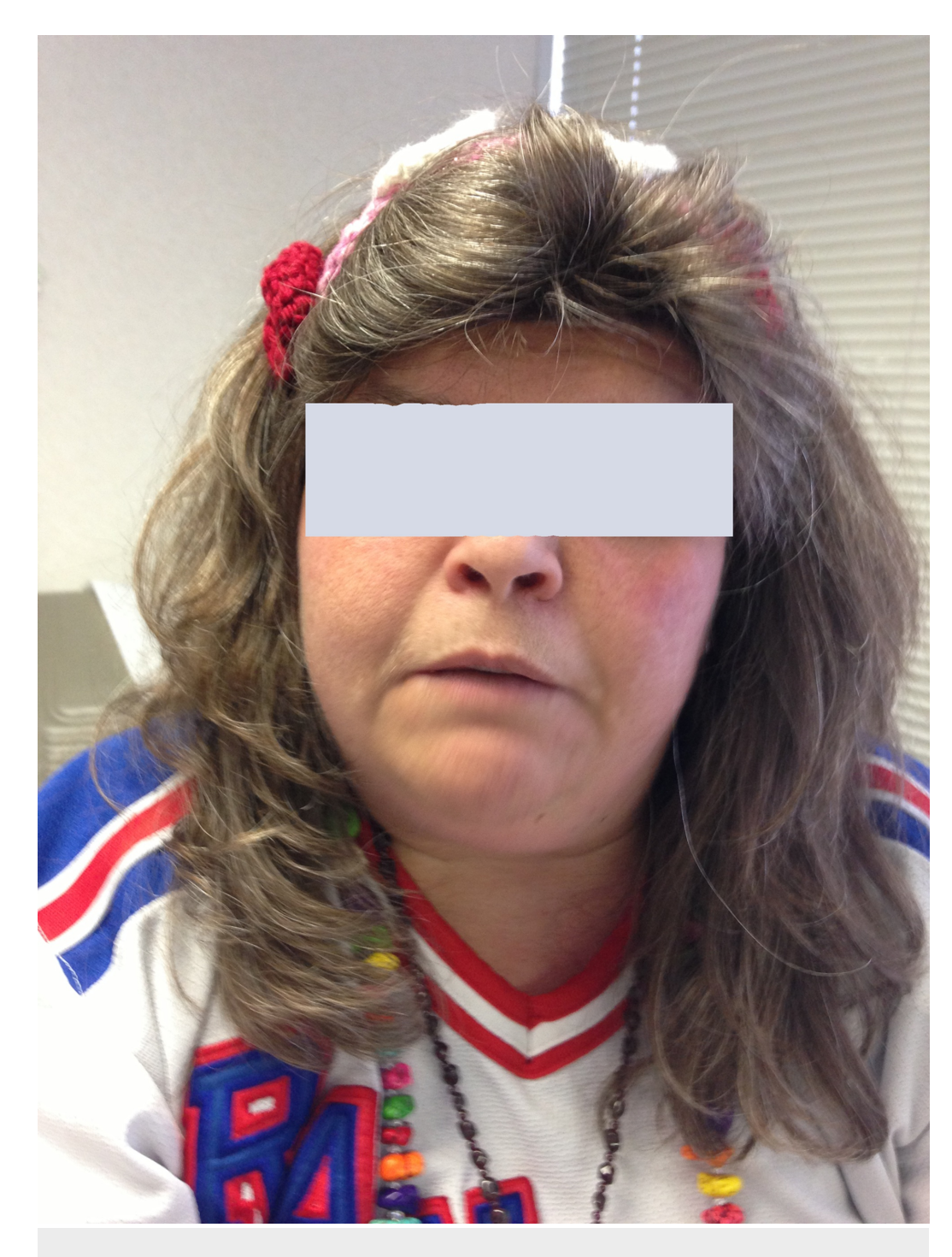
FIGURE 1: Picture of our patient showing round face.