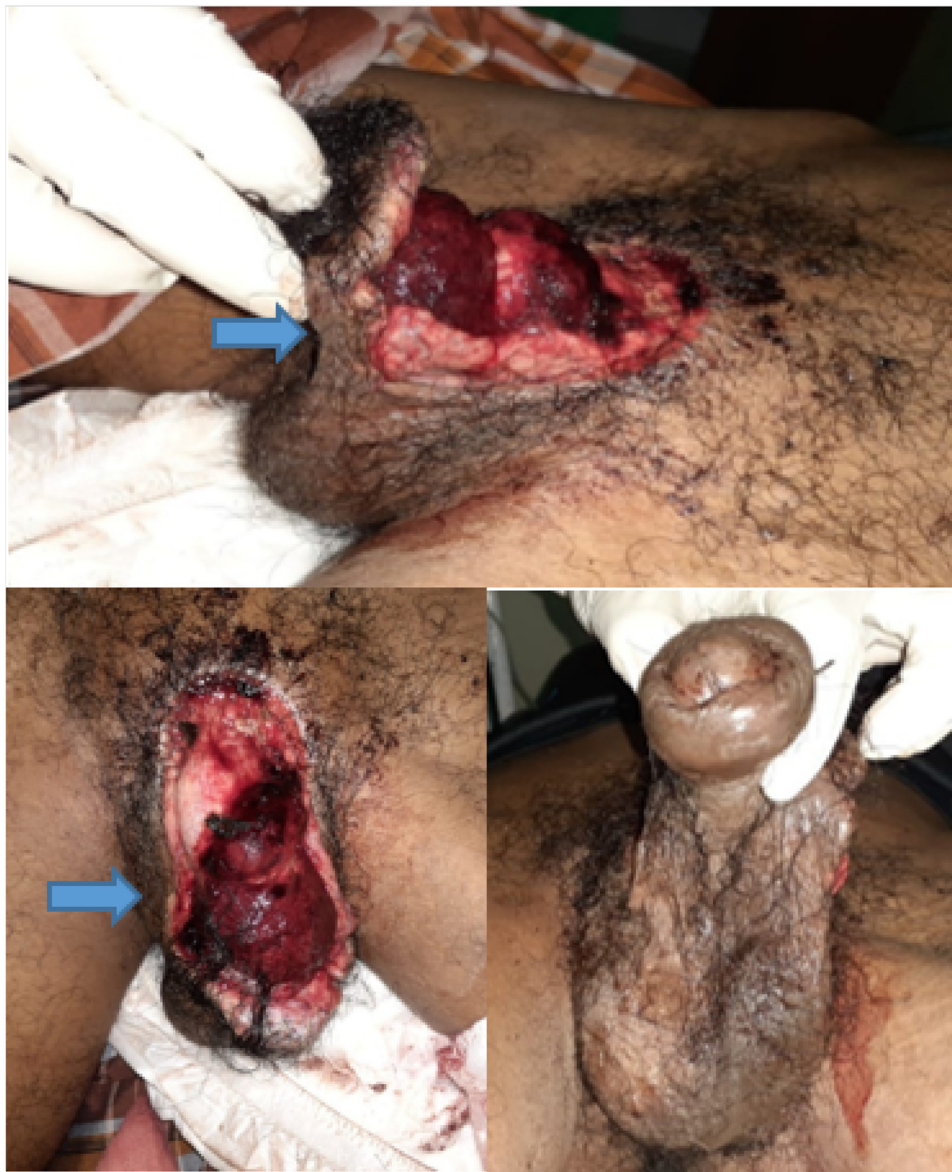
Fig. 1. Subtotal cut of the penis. The penis remained suspended by only a thin ventral part of the penile skin (blue arrow).

and sometimes agitation. The patient's eye contact was poor, and his speech was incoherent. Urological examination showed a subtotal cut of the penis, including the distal part of the mons pubis and the dorsal and lateral parts of the penile skin, and a clear cut through the corpus cavernosum. The penis remained suspended by only a thin ventral part of the penile skin (Fig. 1).