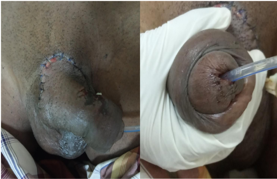
Fig. 4. The surgical wound recovered well, and the penis remained viable.

Intravenous antibiotic ampicillin–sulbactam was administered 3 times daily. After leaving the psychiatric department, the patient received antipsychotic risperidone (2 mg, twice daily) and clozapine (25 mg, once daily). Proper wound care was performed every 2 days to investigate the wound's condition and to ensure successful wound healing.