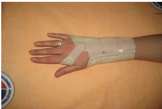
Fig. 1 Splint application

Wrist-hand resting splint to wear at night and additionally MHMT were applied to the group I of patients for 6 weeks. The massage therapy was taught to the patients practically on the first day of their therapy from an experienced physical therapy and rehabilitation physician. On the other days, patients were asked to do the massage by themselves. Furthermore, in case they forgot, in order to remember the massage technique, a CD (compact disk) including visual clip of training was given to the patients. The patients were asked to attend the weekly follow-up visits. The patients who could not attend the follow-up visits were phoned and provided to do the massage completely. Those who attended the follow-up visits were asked to do the massage themselves under physician supervision. They were instantly intervened to correct their mistakes, if any. The patients maintained their therapies under specialist supervision.