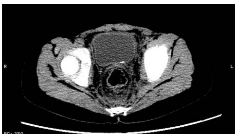
Figure 2. A small strip of high-density shadow was present in the bladder cavity.