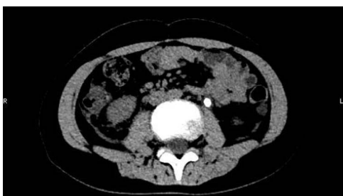
Figure 4. An irregular high-density shadow was present in the left upper ureter.

was present in the left upper ureter (Fig. 4); furthermore, hydronephrosis was apparent in the left renal pelvis. There were no abnormalities in the bladder.