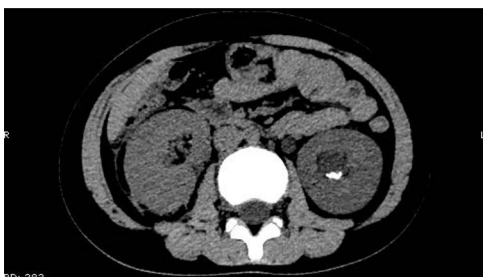
Figure 3. Some irregular high-density shadows persisted in the left renal pelvis, hydronephrosis was apparent in the left renal pelvis.