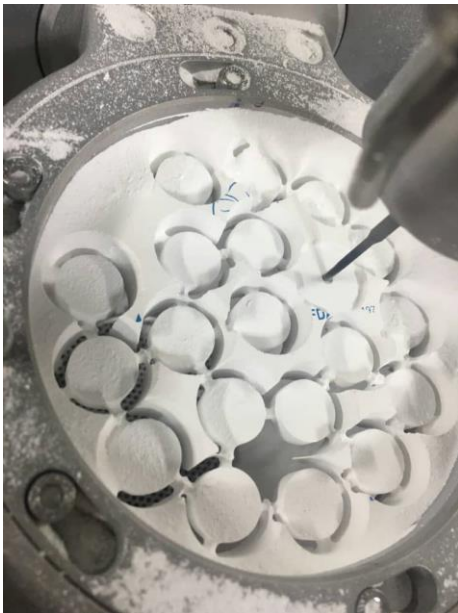
Figure 1. Making zirconia using the CAD-CAM system.

Group 2: Application of tribochemical air abrasion using the Rocatec system (3M ESPE, Washington DC, USA). The air abrasion procedure was conducted using a sandblasting machine, using silica powder with aluminum oxide for 13 seconds at an air pressure of 2.8 bar at a distance of 10 mm from the zirconia surface, immediately followed by the application of the activator (Clearfil porcelain bond activator, Yahishama Co., Tokyo, Japan) on the samples (SMT and SMNT). 21