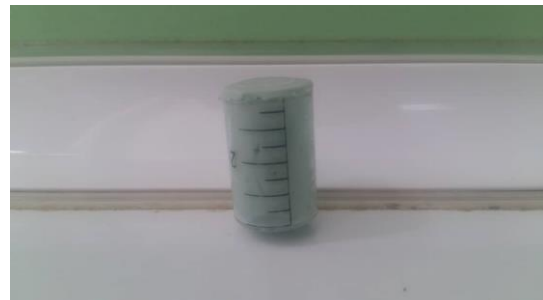
Figure 2. Zirconia core inside the putty mold.

Three types of adhesive, cohesive and mixed fractures were visible based on the fracture site. The results were reported using descriptive statistical methods (means, standard deviations, and percentage frequencies). Independent t-test was used to compare shear bond strengths with and without thermal and mechanical cycles. One-way ANOVA was used to