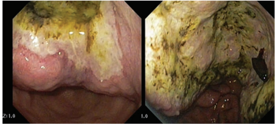
Figure 1. Upper gastrointestinal endoscopic images.

Although BL is one of the first malignancies that showed a complete response to intensive chemotherapy, 32 adult patients particularly at an advanced stage of the disease have a negative prognosis with rapid progression and a high likelihood of CNS metastasis. 33 Initial efforts to treat BL with the usual regimens for NHL failed to show the expected benefits probably due to the high proliferative rate of BL cells which caused the viable tumor cells to recover and re-enter the cell cycle between two chemotherapy cycles. Dose-intensive chemotherapy seems to be the answer to this problem. One of the Indian series reported the use of eight cycles of a dose-intensive MCP 842