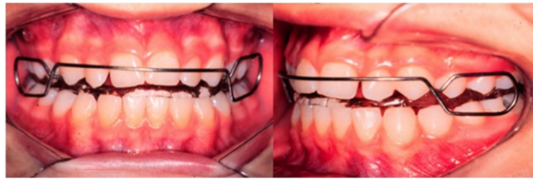
Figure 2 Bionator appliance.

headgear (KHG) for 14 h/day during fixed appliance treatment, as active retention. Others (40%) used class II elastics as active retention, for 14 h/day. These devices were used during 70% of the fixed appliance phase. After removal of the fixed orthodontic appliances, a Hawley plate was used in the maxillary arch and a canine-to-canine bonded retainer was used in the mandibular arch. All patients were treated non-extraction.