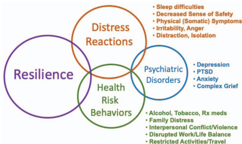
FIGURE 2. Psychological and behavioral responses to pandemics and disasters.

research continues to emerge, there is evidence of profound mental health effects of COVID-19 on HCWs, at all levels of training and experience, 19 which threatens our healthcare response and the ability to ultimately control the pandemic. 20 Personnel are experiencing a range of responses, including distress, insomnia, acute stress, depression, and posttraumatic stress. 21–23 While successive “waves” have come with improved access to protective equipment and enhanced knowledge in the treatment of COVID patients, other challenges have emerged. HCWs are tired and remain concerned about their safety and that of their families. HCWs are working in systems functioning under altered standards of care with rationing of scarce resources exacerbating moral distress. 24,25 Bed capacity, access to critical respiratory equipment, and lack of adequate personnel staff remain commonplace, particularly in hotspot areas.